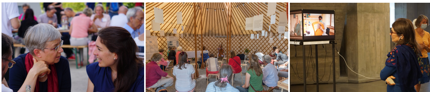
From left to right: Impressions from the world conference: stimulating conversations during the break; concert in the open yurt; video column with short videos from the art therapy department.