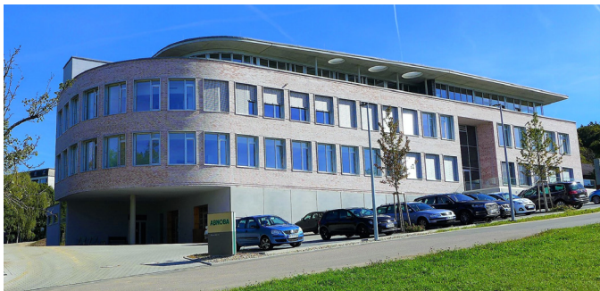
Photo: West side of the new building: to the left of the entrance Abnoba GmbH, to the right of the entrance Carl Gustav Carus Institute.

ern-Öschelbronn/DE was occupied on schedule, despite the coronavirus pandemic and temporary lockdown. The climate-friendly new building is integrated into the site on which Johanneshaus and the Öschelbronn Hospital are also located with their freshly occupied new building. This means an enormous gain in work and development opportunities!