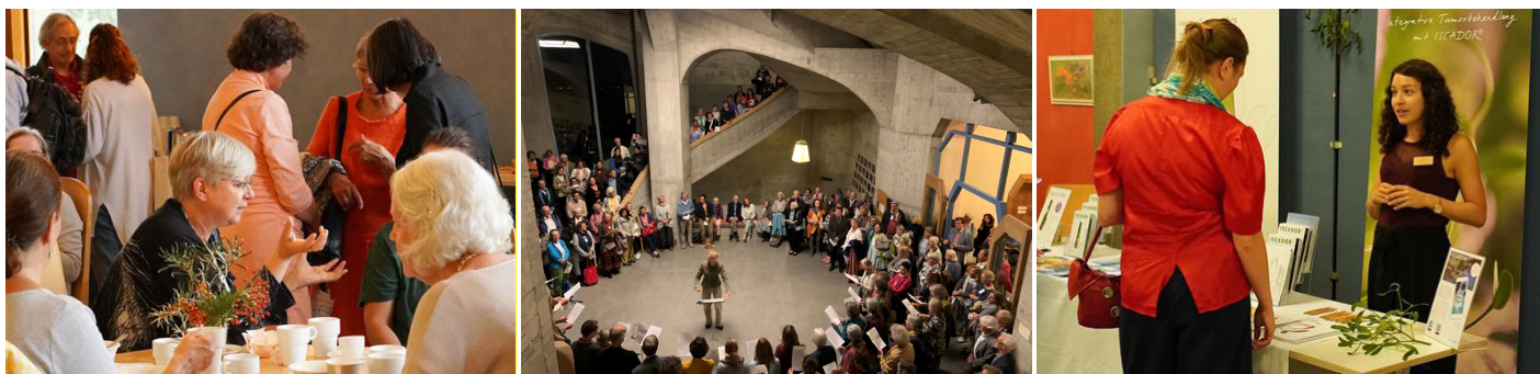
From left to right: The breaks were used for lively discussions. – A wonderful impression came from the morning singing in the sound chamber of the West Staircase. – In the foyer, visitors to the annual conference could obtain information from manufacturers of mistletoe preparations and other anthroposophical treatments; the IVAA, VAOAS and GAÄD, as medical associations for example, also had a stand.

intentions, in order to find a free space and a common language that enables community building and thus a heart quality in working together.