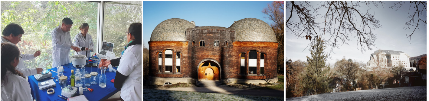
From left to right: Concentrated work during the last module of the further training in anthroposophic pharmacy in Peru in October 2021 which was attended by participants from eight countries; winter in Dornach, occasionally sunny, often foggy: impressions of the Glass House – today home of the Section for Agriculture and of the Natural Science Section – and the Goetheanum from a distance.

Dear Co-workers and Friends of the Medical Section,